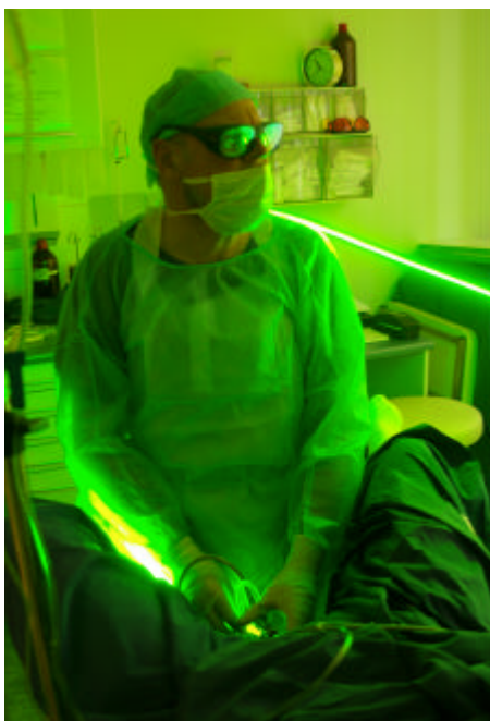
The greenlight laser method using the new 120-watt power laser opens up entirely new therapeutic perspectives; it can be used to treat prostates of virtually any size.

which the light beam can be focussed and the enhanced power output produce a much better vaporization effect; in other words, more tissue is eradicated to a better degree, and this much more