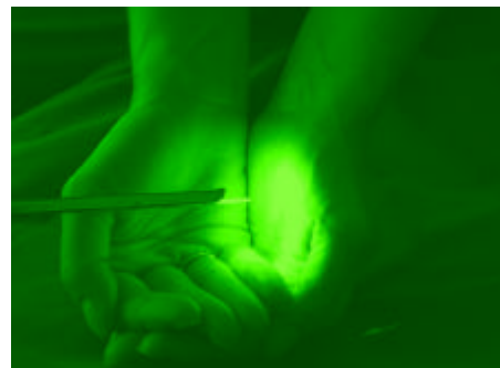
The green light of the Nd:YAG (KTP) laser is specifically adjusted to the absorptive capacity of haemoglobin. However, this photo is for demonstration purposes only: during treatment, protective clothing such as gloves and goggles must be worn, and the intense beam of 120 watts must never be allowed to come into contact with healthy body tissue.

Dr. Deuster: The best is the enemy of the good, as the saying goes; but this will hardly apply to the greenlight laser, since even shorter wavelengths are unsuitable for use in this area. After all, green light is specifically adapted to the absorptive capacity of the blood vessels. Sure, there'll be some minor improvements in the handling or